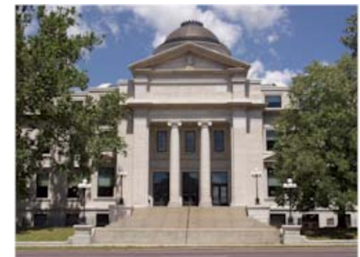
Ola Babcock Miller Building